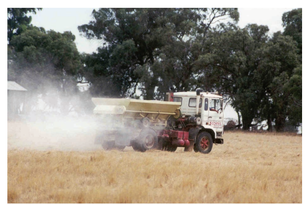
Most pastures in south west Victoria require fertiliser applications to ensure an adequate supply of nutrients for pastures to produce the required amount and quality of feed for livestock

are the elements that are most commonly applied as fertiliser in south west Victoria. Copper may also be required in the fertiliser mix as a precaution against molybdenum-induced copper deficiency.