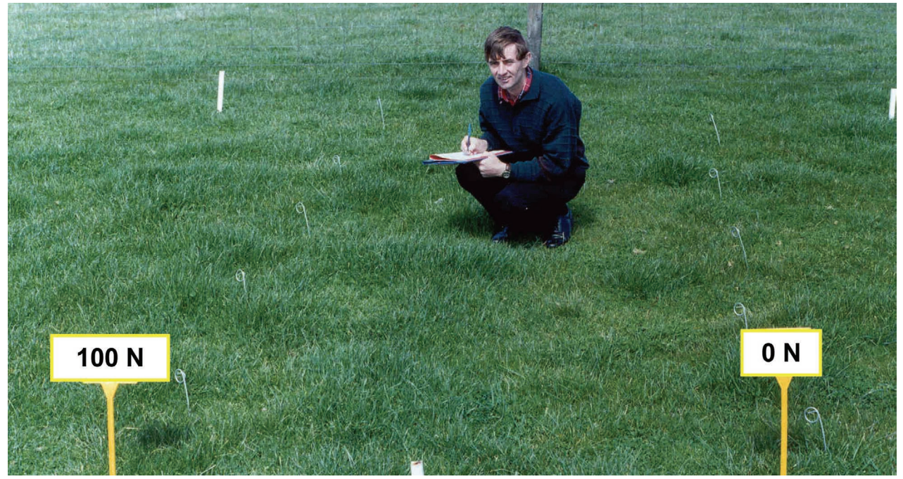
Signs of a pasture suitable for nitrogen application: without nitrogen application (right) there are patches of vigorous growth where dung or urine has supplied nitrogen to about 20% of the area, and the remaining 80% has much lower growth rates. With nitrogen application (left), the whole area has growth rates approaching those of dung and urine patches.