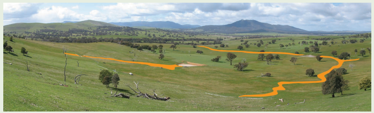
Orange areas show "wet spots" in this landscape, which are sources for a high proportion of surface runoff. The amount of nutrients entering streams can be significantly reduced by eliminating fertiliser application to areas generating surface runoff.

Pasture management that takes into account the way that surface runoff is generated can minimise the effect of high soil fertility on the environment. Surface runoff from pasture areas close to streams, soaks and other wet spots contributes most of the water that eventually reaches streams and waterways. These areas should be managed as low-fertility pastures, i.e. minimal or no fertiliser applications, while the remainder of the paddock can be fertilised for productive purposes.