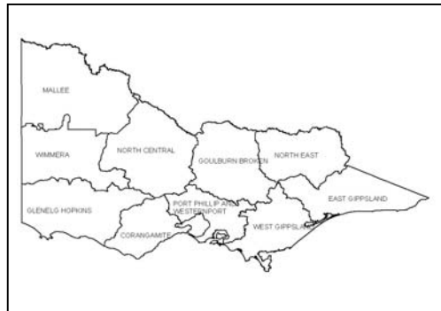
Figure 1. Victorian Catchment Management Regions.

The noxious weed categories have to be relevant at two different scales, CMA regional and Statewide, depending upon the declared weed category level. Because of the complexity of the issue, a decision support framework, utilising information from weed scientists, regional staff and community consultation (Figure 2) was followed.